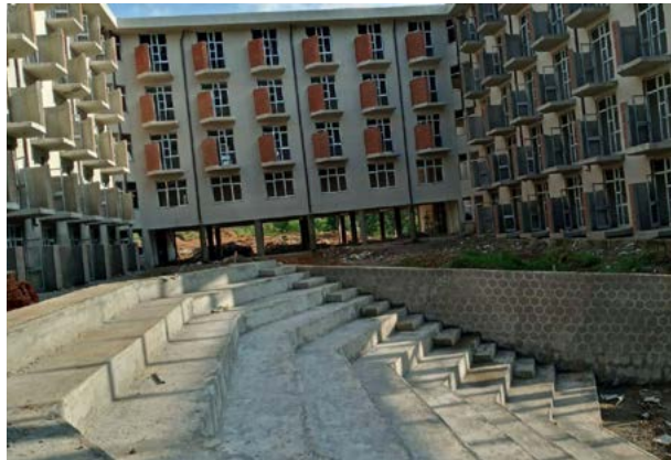
Project Name Mizan Tepi University