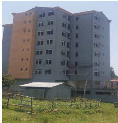
Project Name Saving House Project