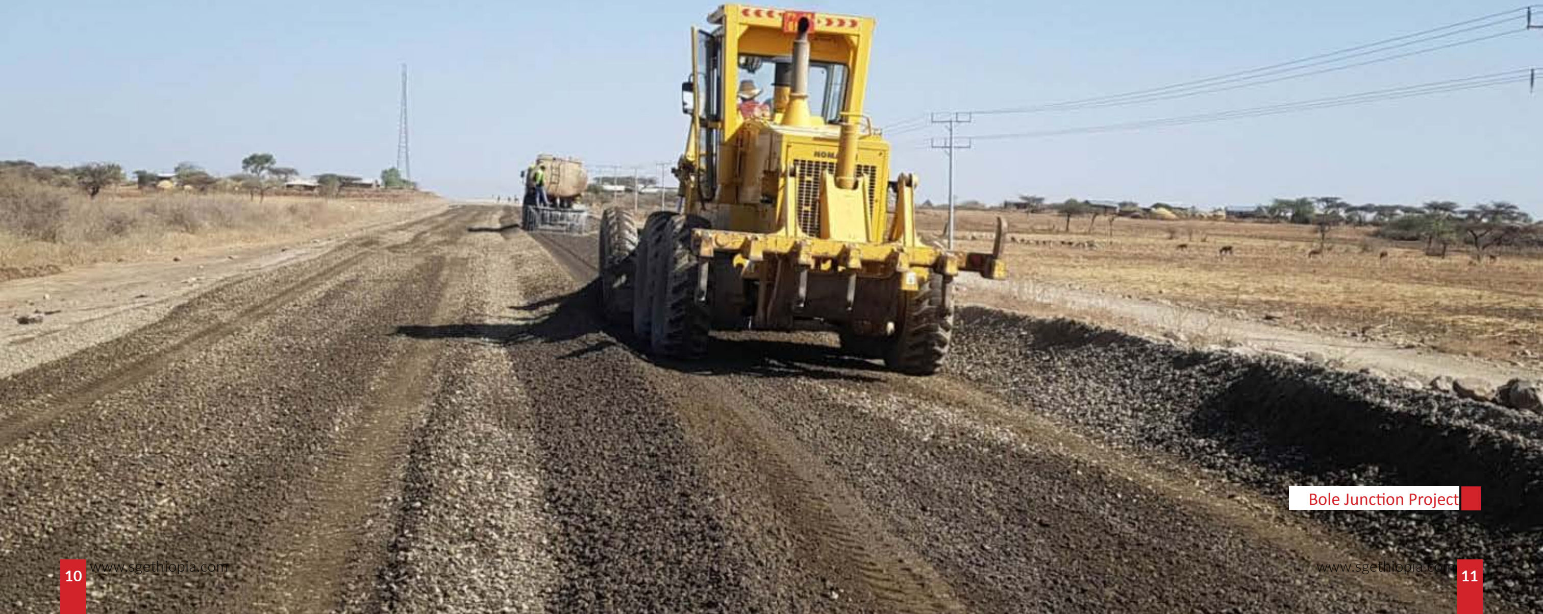
Bole Junction Project